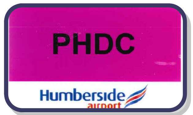
Passenger with a Hidden Disability Carer